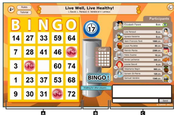
Figure 1: Live Well, Live Healthy!

According to a survey of 932 Canadian seniors (Kaufman et al., 2014), the Bingo game was found to be the most frequently one mentioned by respondents. Figure 1 represents the Live Well, Live Healthy! game interface which is divided into three parts: a) the Bingo card, rules and tutorial; b) information on the game's progress: the type of game, randomly drawn ball, and the Bingo button for ending the game; and c) information related to the players' actions: players' names and scores, as well as the microphone and chat control buttons.